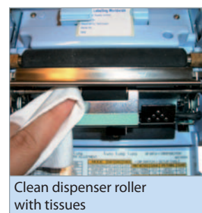
Clean dispenser roller with tissues