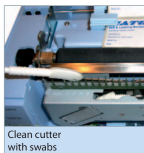
Clean cutter with swabs