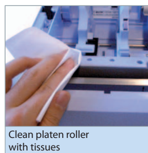
Clean platen roller with tissues