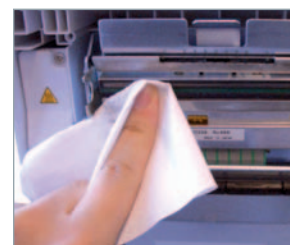
Clean printhead with tissues